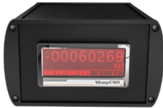
Table housing TG9648