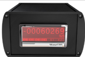
Table housing TG9648